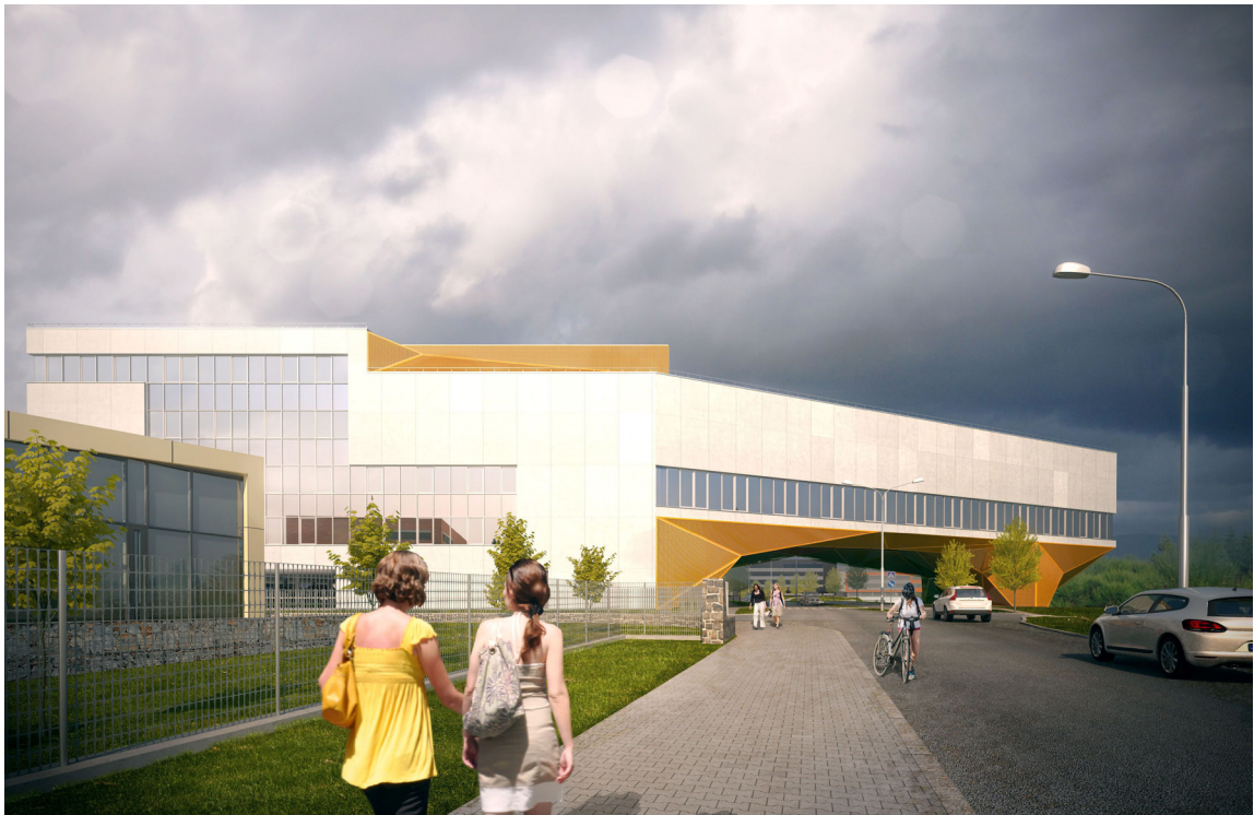
FIGURE 1. Simulation Centre visualization