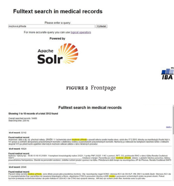
FIGURE 3 Results of search with highlighted keywords