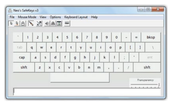
Figure 1: On screen keyboard Neo's SafeKeys defeats keyloggers very efficiently