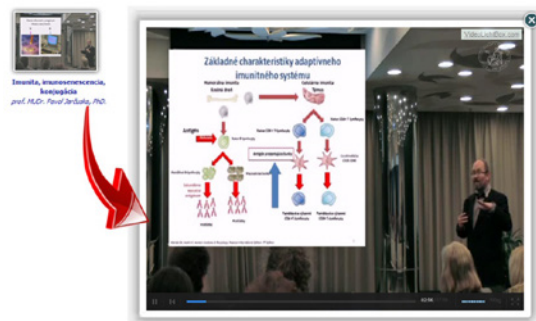
Figure 2: Video thumbnail and FLV player embedded in portal's article

Here, considering the technical point of view, the selection of the most convenient video format was one of the most important parts for us. There are two preferred video formats to share video content on the web. These are MP4 and FLV, and both containers have their pros and cons. Because the flash was the most relevant target platform for many years, and because it uses progressive download, can be downloaded from start to finish over HTTP, plays as the file