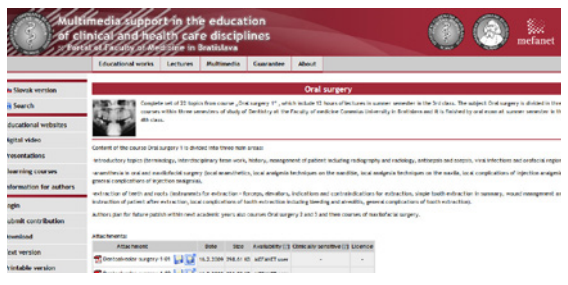
Figure 1: Dental study programs<sup>5</sup> – MEFANET – Faculty of Medicine Comenius University in Bratislava portal