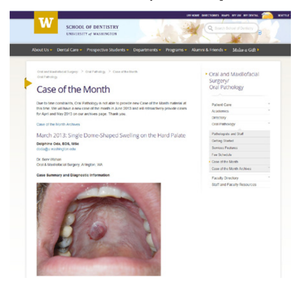
Figure 2: International WEB dental faculties' open sources – School of Dentistry – University of Washington

Figure 1: Dental study programs<sup>5</sup> – MEFANET – Faculty of Medicine Comenius University in Bratislava portal