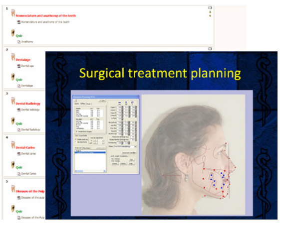
Figure 4: Interactive treatment planning

The statistical significant differences were found in the results of the questionnaire based on five-point